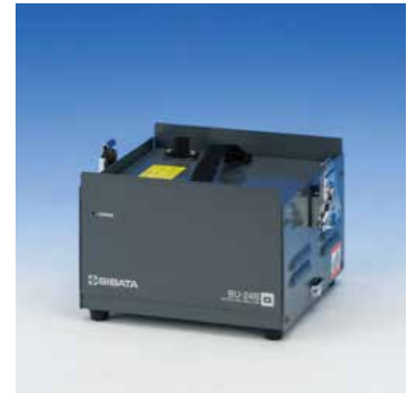
BU-24B (sold separately)