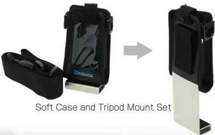
Soft Case and Tripod Mount Set