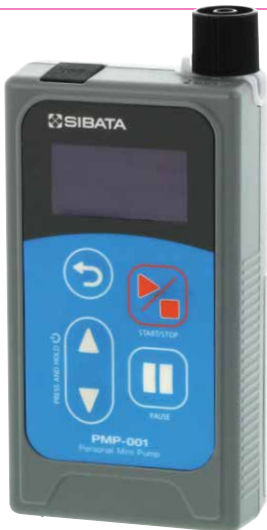
Personal MiniPump PMP-001

*Specifications when a special orifice adapter is connected