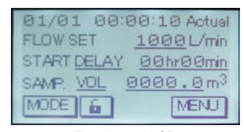
Touch panel LCD