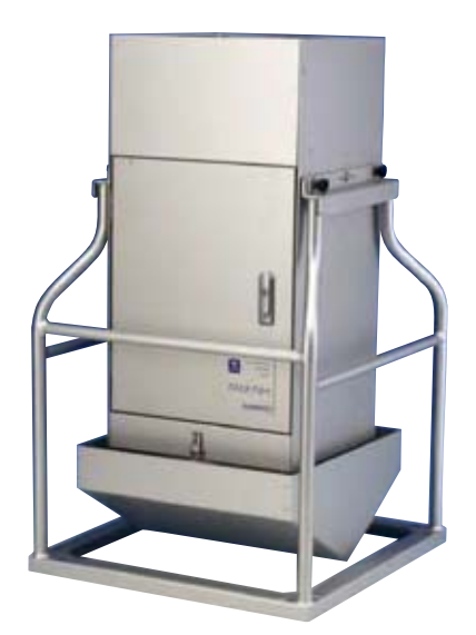
Fold up HV-RW